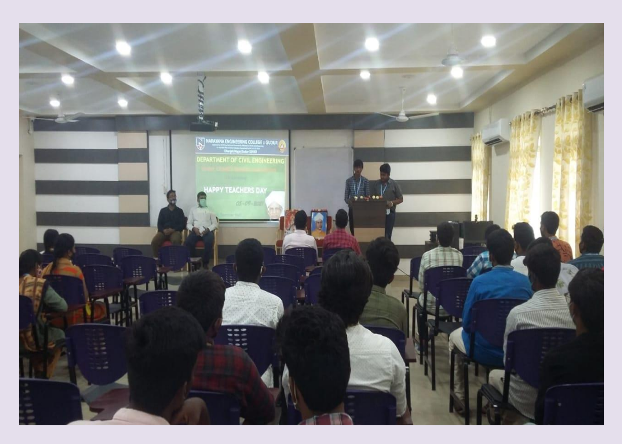
Students attended during event