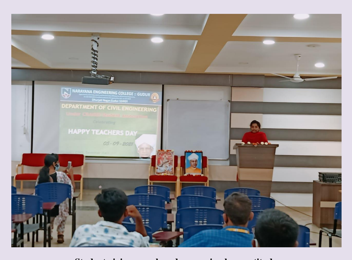
Student giving speech and expressing her gratitude